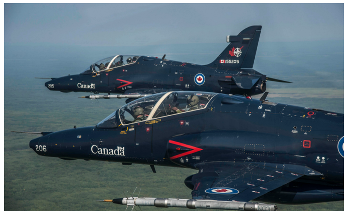
The NATO Flying Training in Canada (NFTC) program is managed by CAE.

"But wait, there's more!" Daniel continues. "We had separate scheduling tools and resource loading tools that were completely independent of that data set."